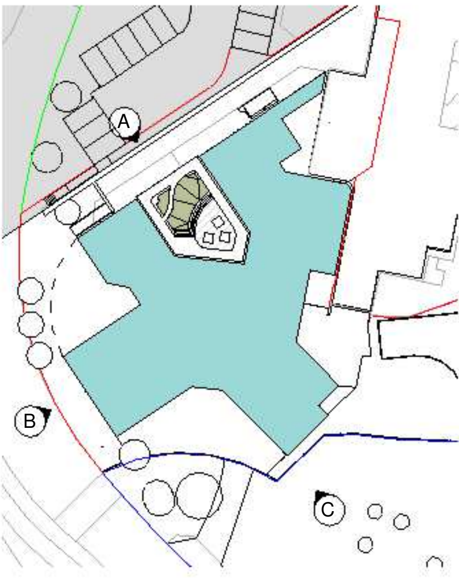
1 Key Plan 1 : 500